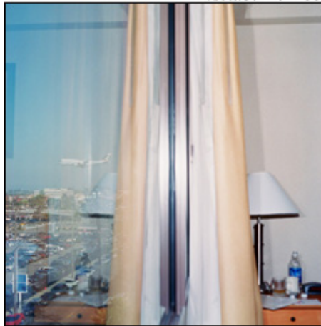
"LAX COURTYARD BY MARRIOTT" 2005