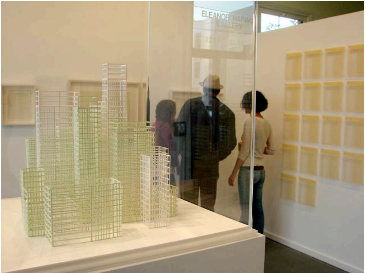
Ledger page highrise art.