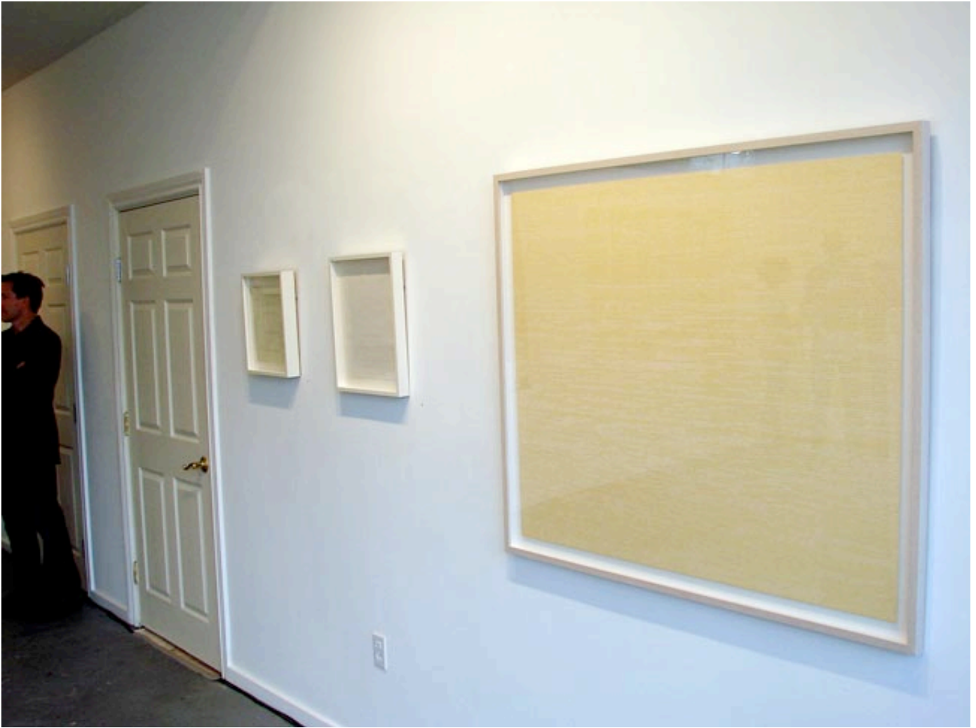
Ledger page cutout collage art.